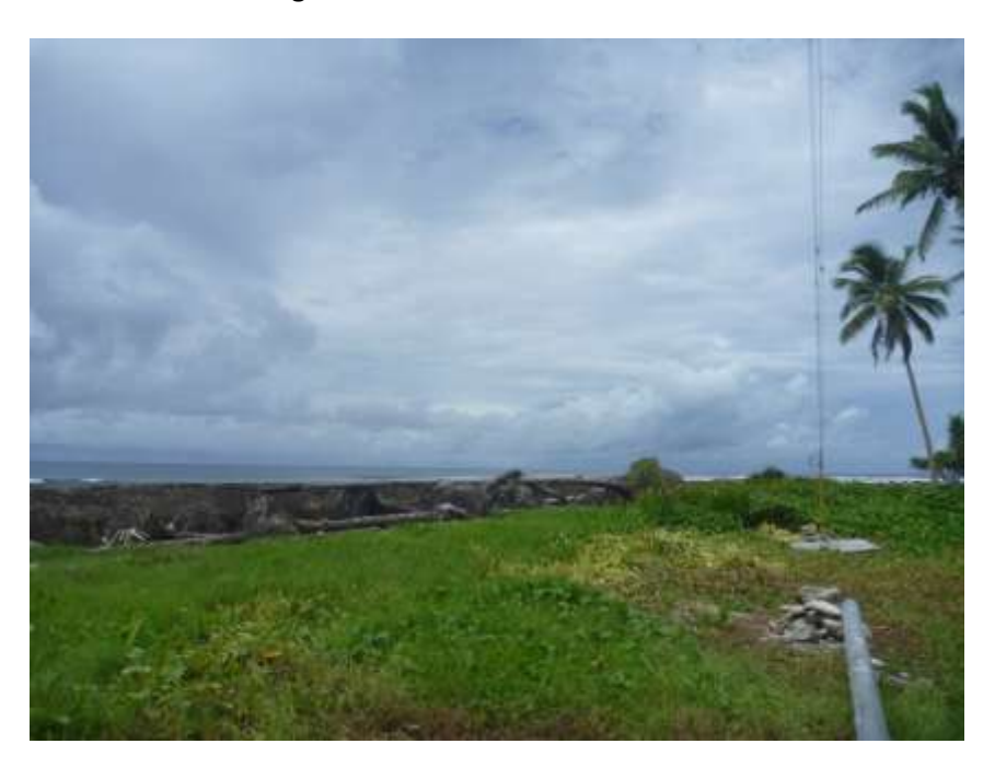
Mast location looking South: